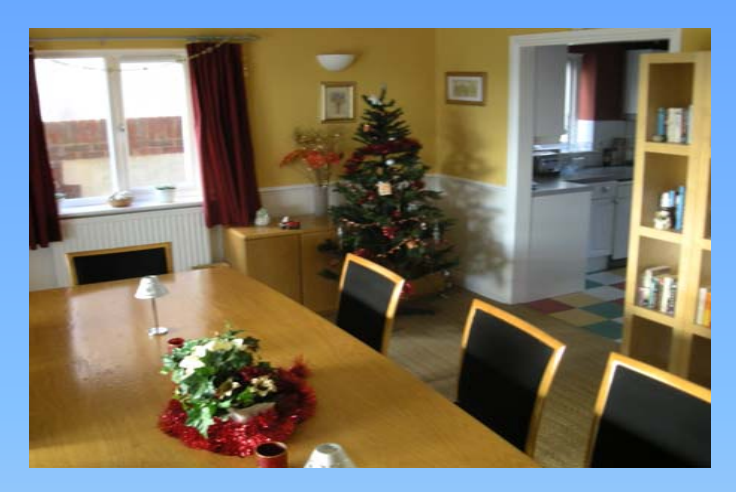
Ground floor: Well equipped kitchen, large dining room, shower room & toilet