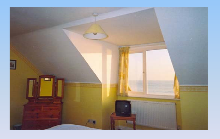
Second floor: 2 x Double bedrooms, Connecting shower room