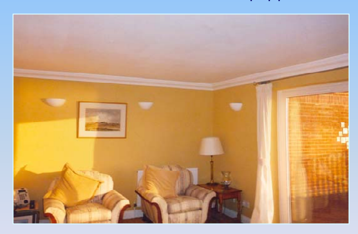
First Floor: Lounge with balcony overlooking the beach Bathroom with shower in bath Twin bedroom, Bunk bedroom (two bunks)